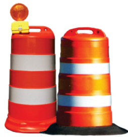
BARRELS AND DRUMS