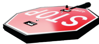
STOP/ SLOW PADDELS