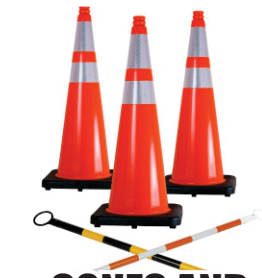
CONES AND CONE BARS