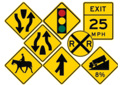
RIGID WARNING SIGNS