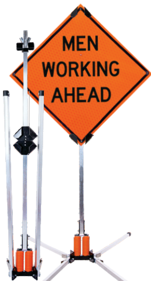
FULL SIZE SIGN STANDS